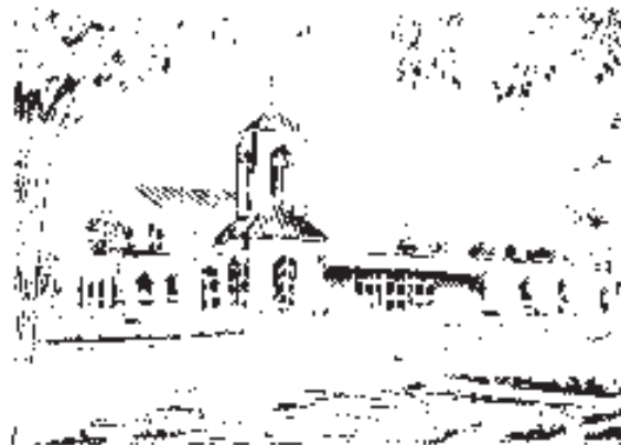
Our Lady of the Lake 129 Metro Road North, Keswick, ON L4P 3C8 Telephone: 905-476-0097 Fax: 905-476-0897