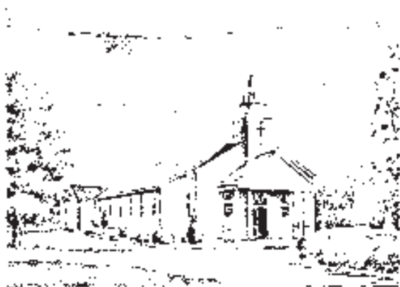
Immaculate Conception 20916 Dalton Road, Box 128, Sutton West, ON L0E 1R0 parish@immaculateconception.on.ca